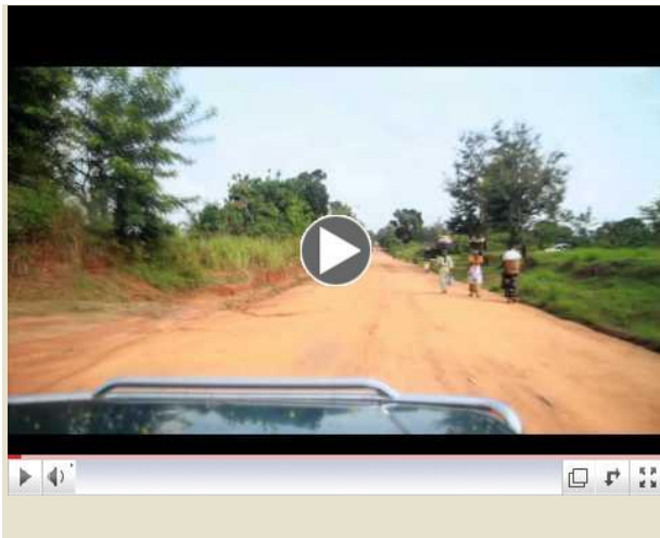
Combating Sexual Violence in the Democratic Republic of Congo (DRC)